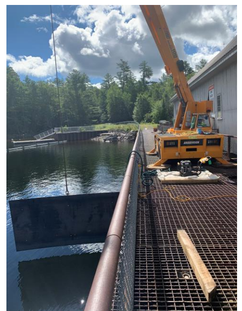
2020 Middle Dam Project Highlights - Left Photo: New gatehouse floor installation. Center Photo: Gate section installation. Right Photo: Prepping to install steel plating on upstream face of Pier 5